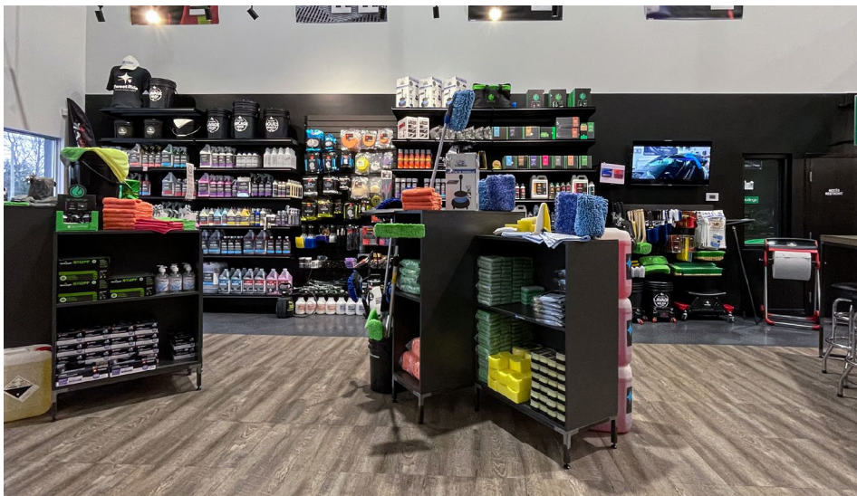
Smoked Oak combined with Diamond tiles for a high-end style